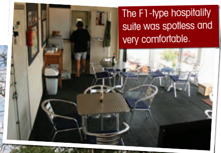
The F1-type hospitality suite was spotless and very comfortable.

people and a fully-fitted stainless steel kitchen. It is equipped with Sky TV, mobile phone charging points, fresh drinking water, and Internet access is to be installed shortly. Anglers can enjoy meals and share a beer or a bottle of red wine or two over friendly chat in the conservatory that overlooks the lake. If the fishing is a tad slow, I'm sure Backdraft's stories will keep you all entertained for hours. For those of you who don't know him, he's a real card!