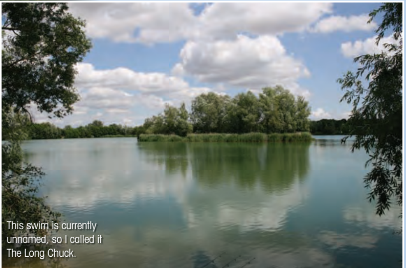
This swim is currently unnamed, so I called it The Long Chuck.

offer, you've just got to find them, and if you ask me nicely I could always let you have a map.