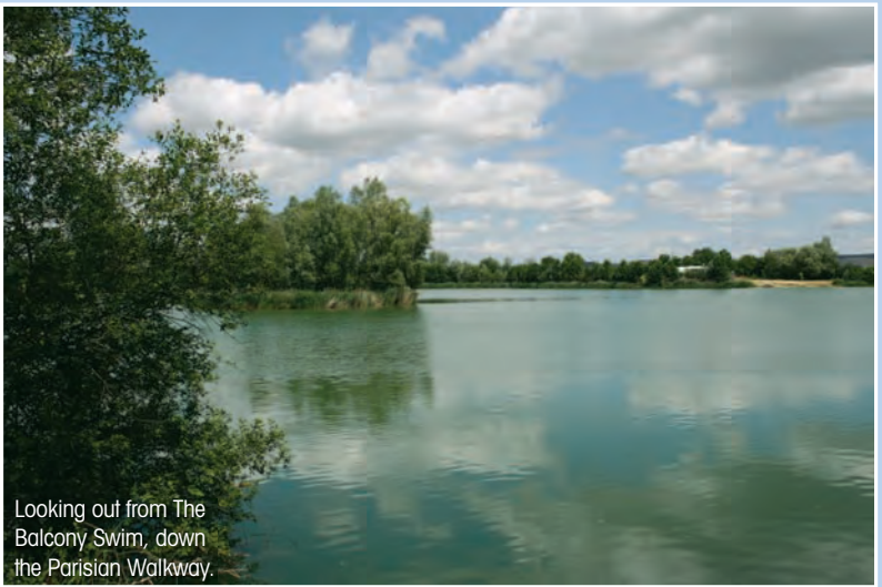
Looking out from The Balcony Swim, down the Parisian Walkway.