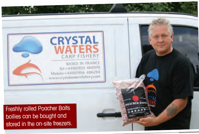
Freshly rolled Poacher Baits boilies can be bought and stored in the on-site freezers.

Both Jon and I had runs from the near marginal shelf, and a large weedbed to the left of Jon's swims was a natural holding area for the carp. Jon managed to continually trickle in Poacher Baits' Tiger and Maple boilies every hour and had five runs in the space of a morning's angling, one double, three 20s and a lost fish. Nice. Top angling, mate! My hottest area was on a 10ft plateau on the front of an island point (not an easy chuck at 140yds), baited with pellets and Poacher Baits' Fruit Frenzy. We were lucky enough to use H Blocks as an aid for accuracy and it definitely made casting and hitting the mark in lower light a lot easier. The carp responded very