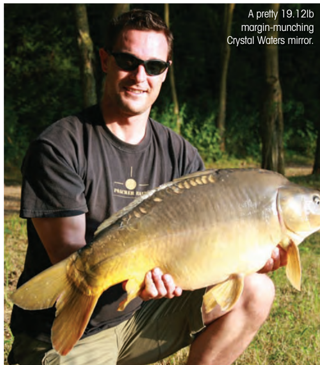
A pretty 19.12lb margin-munching Crystal Waters mirror.