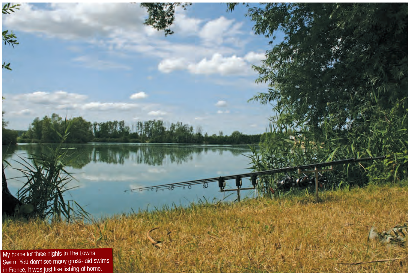
My home for three nights in The Lawns Swim. You don't see many grass-laid swims in France, it was just like fishing at home.