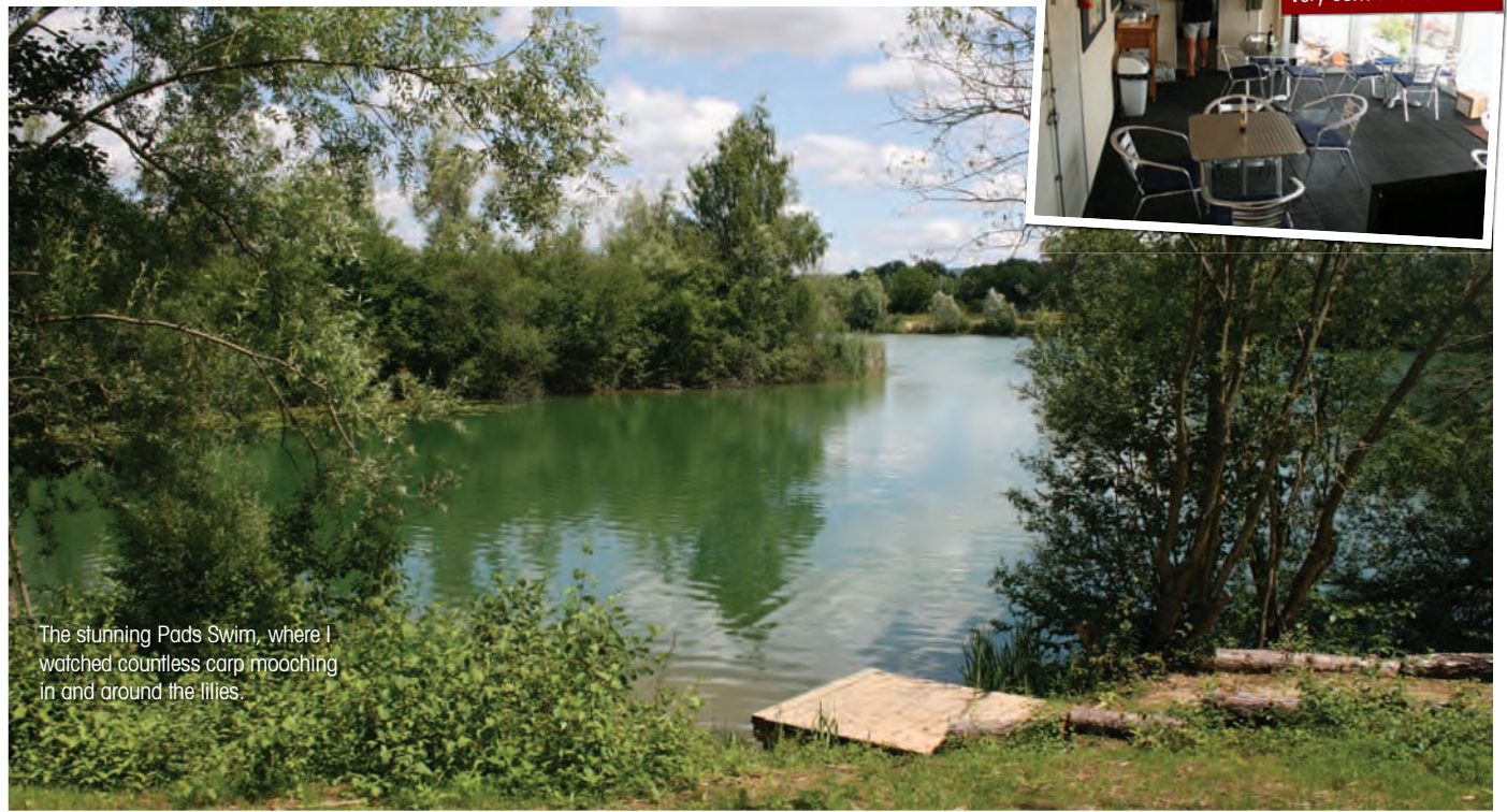
The stunning Pads Swim, where I watched countless carp mooching in and around the lilies.